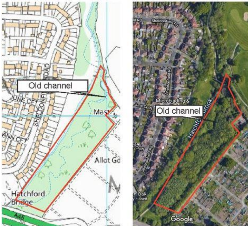
Figure 2 Area of woodland management